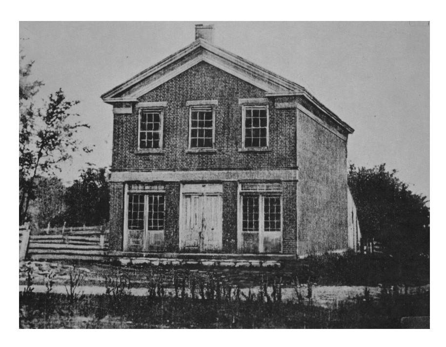
Figure 3. Joseph Smith's Red Brick Store , photograph attributed to Elder Brigham H. Roberts, ca. 1886<sup>47</sup>

all the apostles who were or could have been present for the "Last Charge" meeting had already been endowed, and all except Amasa Lyman also had been sealed to their wives and had received the fulness of the priesthood. <sup>48</sup> Although one might argue that the endowment might have been (re)done for the sake of the Twelve at an additional time for symbolic or instructional purposes, on this occasion it would seem not only "uncalled for" and "unnecessary," but also "inappropriate." Moreover, since it is known that during the morning session of the Council of Fifty meeting on 26 March there was "no discussion of or exercise of priesthood keys, no ordinations, no ordinances, no discussion of temple teachings or other church doctrine," <sup>50</sup> any such ordinances would have had to have been performed at an unseasonably early hour (inconsistent with other endowment sessions, which were performed in the afternoon) so they could be completed and the upper floor could be set up for the 9:00 AM Council meeting.