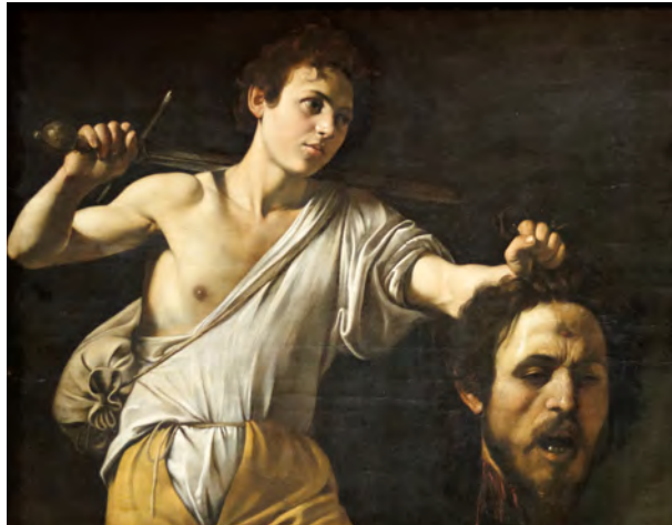
Figure 3. Michelangelo Merisi da Caravaggio (Le Carvage), 1571-1610: David with the Head of Goliath, 1607. In a prophecy “of old” that is later applied to David we read: “I have set a youth above the warrior; I have [exalted] a young man over the people.” 32 The youth (Hebrew bahur) who is set above the warrior (Hebrew gibbor) recalls Enoch’s victory as a “lad” (Hebrew na’ar) over the warriors (Hebrew gibborim) in the Dead Sea Scrolls Book of Giants and in the book of Moses. 33

We find no account of a river’s course turned by anyone in the Bible. However, such a story appears in this pseudepigraphal account and in its counterpart in Joseph Smith’s revelations — in both instances within the story of Enoch.