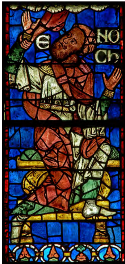
Figure 9. Enoch Window at Canterbury Cathedral, ca. 1178-1180. Enoch is shown here with upraised hands in the traditional attitude of prayer. The right hand of God emerges from the cloud to grasp the wrist of Enoch and lift him to heaven

ancient suggestions” stemmed from his “charismatic accuracy, his sure sense of relevance that governed biblical and Mormon parallels.” Having studied the life and revelations of the Prophet, Bloom concludes: “I hardly think that written sources were necessary.” While expressing “no judgment, one way or the other, upon the authenticity” of LDS scripture, he found “enormous validity” in these writings and could “only attribute to [the Prophet’s] genius or daemon” his ability to “recapture ... crucial elements in the archaic Jewish religion ... that had ceased to be available either to normative Judaism or to Christianity, and that survived only in esoteric traditions unlikely to have touched [Joseph] Smith directly.” 162