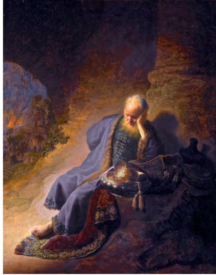
Figure 5. Rembrandt Harmenszoon van Rijn, 1606-1669: Jeremiah Laments the Destruction of Jerusalem , 1630.