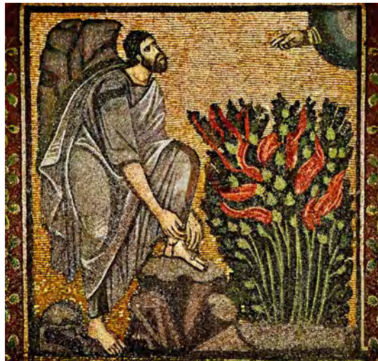
Figure 2. Moses and the Burning Bush, St. Catherine's Monastery, ca. 548-560.

Enoch's call. LDS scholar Stephen Ricks has shown how the six characteristic features of the Old Testament narrative call pattern identified by Norman Habel are shown in the commissioning of Joseph Smith's Enoch. 26 According to non-Mormon scholar Samuel Zinner, 27 the ideas behind the unusual wording found within Enoch's prophetic commission in the book of Moses arose in the matrix of the ancient Enoch literature. 28