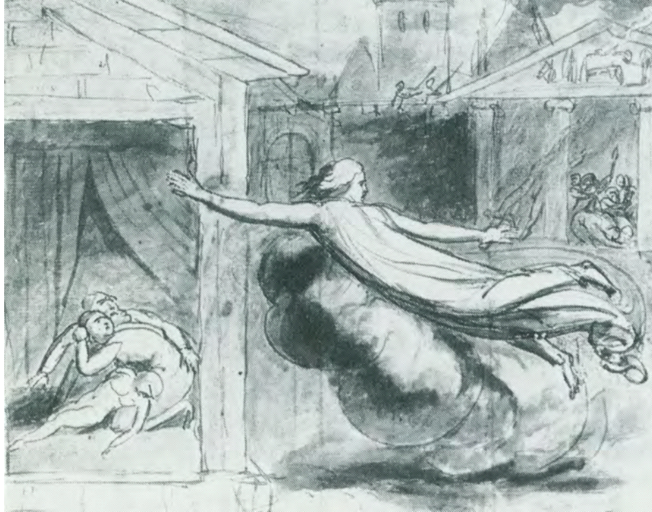
Figure 6. William Blake, 1757-1827: Sketch for “War Unchained by an Angel — Fire, Pestilence, and Famine Following, ca. 1780-1784. Speaking as if he were standing before this scene, John Bright (1811–1889), a Quaker, movingly addressed the English House of Commons in opposition to the Crimean War: “The angel of death has been abroad throughout the land; you may almost hear the beating of his wings. There is no one as of old ... to sprinkle with blood the lintel and the two side-posts of our doors, that he may spare and pass on; he takes his victims from the castle of the noble, the mansion of the wealthy, and the cottage of the poor and lowly.” 78

Consistent with the concept of the gibborim as “mighty warriors,” Joseph Smith’s Enoch writings describe scenes of wars, bloodshed, and slaughter among the people. 79 For example, in Moses 6:15 we read: 80