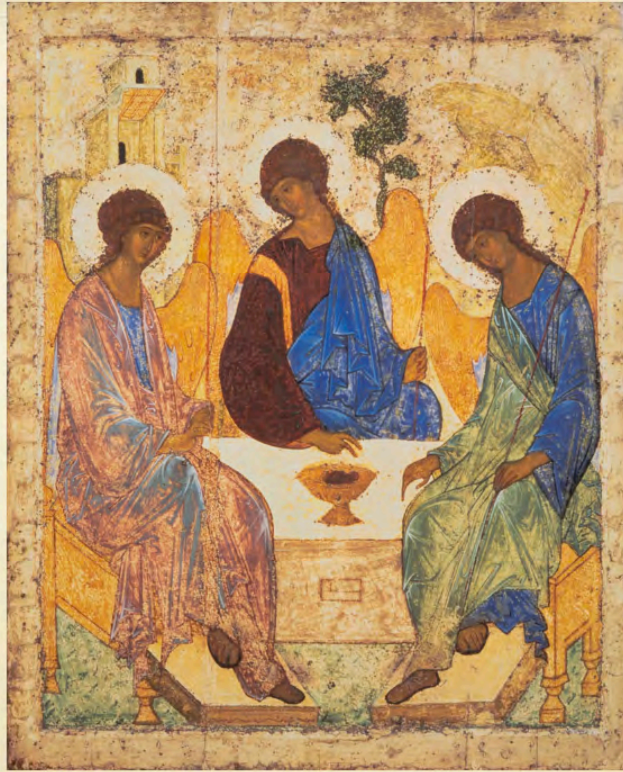
Andrei Rublev, ca. 1360-70-ca. 1427-30: The Holy Trinity , ca. 1408-1425

A parallel account involving three divine messengers can be found in the story of Abraham. 30 In the Orthodox Church, the famous icon by representing this event is used as a symbol of the oneness of the Godhead, and the “beginning of the promise of Redemption” which reached “its fulfillment on the day of the Pentecost,” binding together the Old Testament and New Testament Churches. 31