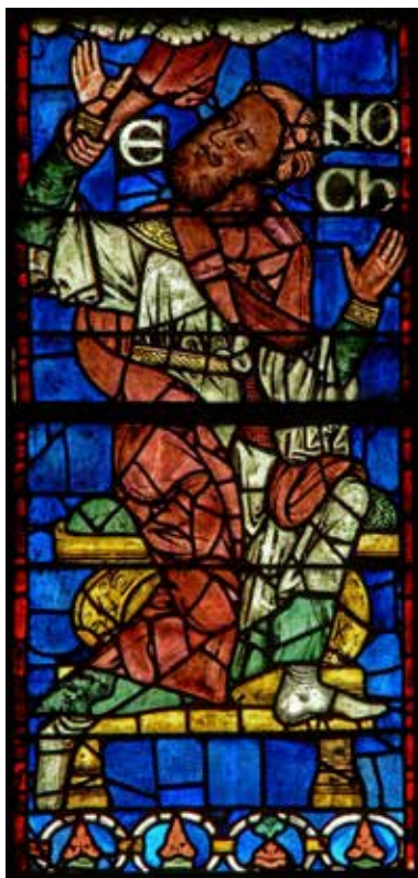
Figure 8. Enoch Window at Canterbury Cathedral, ca. 1178–1180. 127 Enoch is shown here with upraised hands in the traditional attitude of prayer. The right hand of God emerges from the cloud to grasp the wrist of Enoch and lift him to heaven.