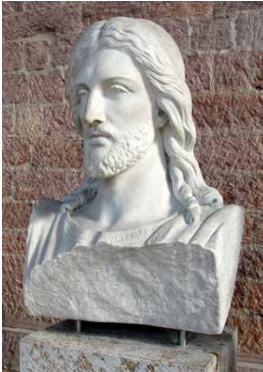
Figure 3. Gustav Kaupert, 1819–1897: Jesus Christ, 1880. Located in the Protestant Church of the Redeemer, formerly the Roman Palace Basilica of Constantine (Aula Palatina), Trier, Germany. 28

Consistent with the conclusions of Enoch scholars George W. Nickelsburg and James C. VanderKam about the use of these multiple titles in the Book of Parables , 29 the Book of Moses applies them all to a single individual. 30 Moreover, Moses 6:57 gives a single, specific description of the role of the Son of Man as a “righteous judge.” 31 According to Nickelsburg and VanderKam, 32 this conception is highly characteristic of the Book of Parables , where the primary role of the Son of Man is also that of a judge. Chapters 70–71 close the Book of Parables by describing Enoch being hidden from those on earth, ascending to heaven, acquiring all of the knowledge of the secrets of heaven, and experiencing a vision of the angels and others dwelling with God. In somewhat of a surprise ending, Enoch is declared to be the Son of Man — or perhaps, more descriptively and in line with modern scripture, a Son of Man. 33