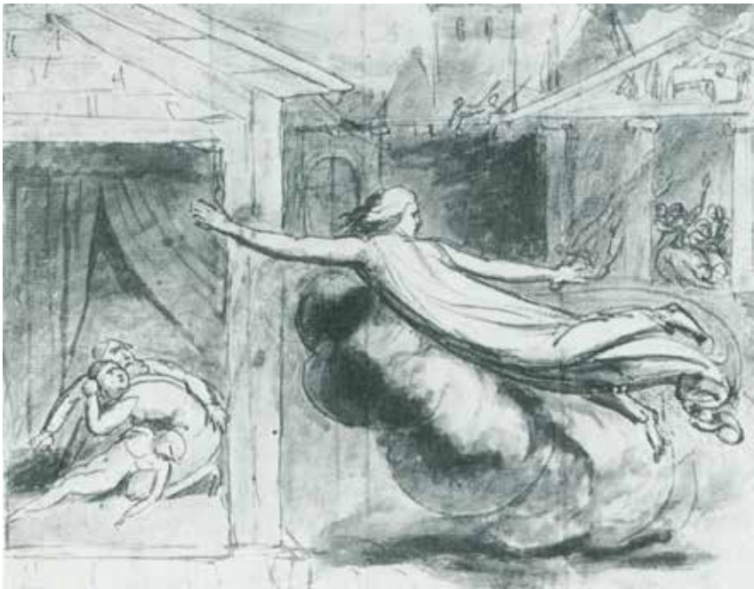
Figure 7. William Blake (1757–1827): Sketch for “War Unchained by an Angel — Fire, Pestilence, and Famine Following,” ca. 1780–1784. 93

Reeves and Reed take Yamaḥuel to be an intended reference to the biblical Mehujael, 91 a name whose relationship to Mahawai in the Aramaic Book of Giants and of Mahujah/Mahijah in Moses 6–7 we have discussed previously. Significantly, Yamaḥuel's primary role in the Islamic text is to ask questions, 92 just as it is in the Book of Moses and the Book of Giants .