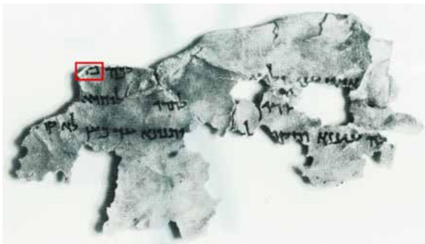
Figure 5. Fragment of the Qumran Book of Giants (4Q203) containing the first part of the personal name MH̄WY (outlined in red). 57 In modern translations, the name is usually transliterated as “Mahawai.” Hugh Nibley was the first to suggest a correspondence between this Book of Giants character and the names Mahijah/Mahujah in the Book of Moses. 58 Unlike many of the other poorly preserved Aramaic fragments of the Book of Giants, the translation of this one is straightforward: “(5) [...] to you, Mah[awai ...] (6) the two tablets [...] (7) and the second has not been read up till now.” 59