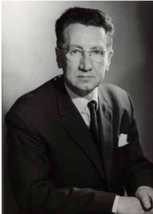
Figure 6. Walter Bird (1903–1969): Photographic portrait of Matthew Black (1908–1994), 1965. 72