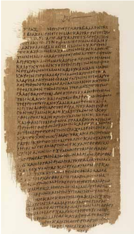
Figure 2. Book of Enoch P, Chester Beatty XII, leaf 3 (Verso), 4th century. 13 The leaf shown includes the portions of 1 Enoch cited in Jude 1:14–15.