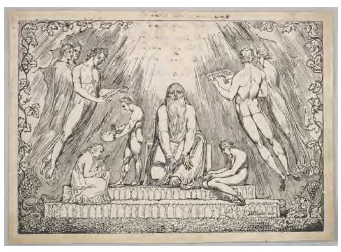
Figure 1. In this lithograph, Enoch is honored as he takes a position on a raised dais. Reputed in Jewish tradition to have invented writing, Enoch holds a book containing Hebrew letters. Angelic beings on each side represent the gifts of prophecy and inspiration.<sup>56</sup>

Consistent both with the teachings of Moses 6:57 and Nickelsburg and VanderKam's conclusions that the various titles mentioned in the Similitudes refer to a single individual, James Waddell argued not only that the "five specific epithets . . . refer to the same messiah figure" but also, significantly, that the "author(s) of the [book] understood the messiah figure to be distinct from the divine figure who is the one God." 55